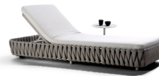
Lounger + Drop side table

Our furniture is designed to lay back and relax, enjoy the sun or watch a beautiful sunset. What better place than to lie on an elegant Tosca lounge or snooze away with your loved ones in a Tosca daybed? Our Nomad poufs, also designed by Monica Armani, serve different functions whatever the moment requires; footstool, side table or additional seating.