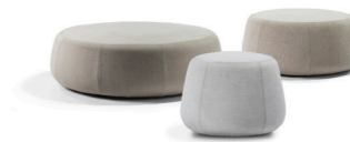
Nomad pouf Ø122cm – Ø92cm – Ø61cm