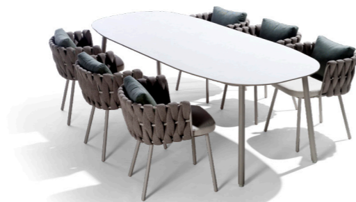
Table 240x98cm — Armchair 6x in salon — Armchair 3x in cockpit