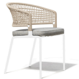
CTR armchair 3x