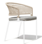
CTR armchair 8x

The Illum table, designed by Marc Merckx and Pieter Maes, has a width of 71cm which enhances the intimate feeling at family & friends dinners. The table with slender legs in white powdercoated aluminium is kept pure and simple. The top in ceramic is glued on glass, which enhances the solidity, and has a subtle cloudy pattern. The linen colour matches beautifully with the linen weave of the eight CTR armchairs.