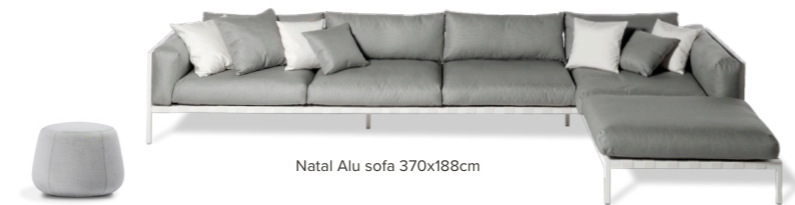
Natal Alu sofa 370x188cm

A CTR club chair, a large coffee table with top in Indonesian plantation teak and a side table in linen aluminium complement the whole.