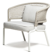
CTR club chair