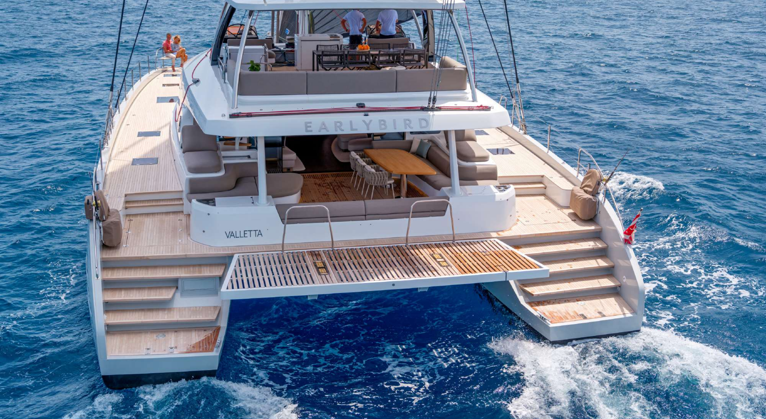
Earlybird - Mention obligatoire / Mandatory credit: Photo Nicolas Claris